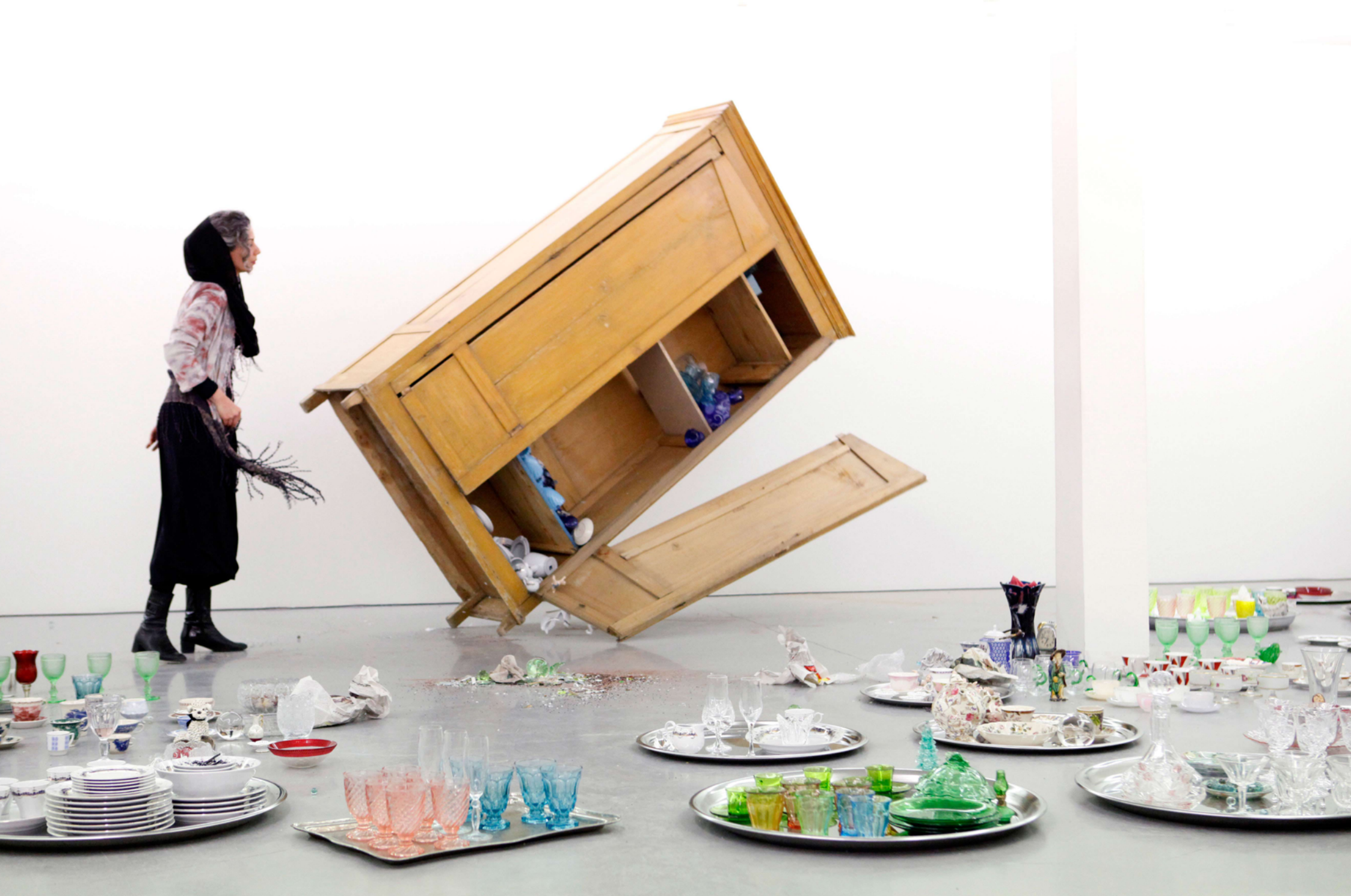
“Oscillation”, 2014, Installation and Performance, Tehran