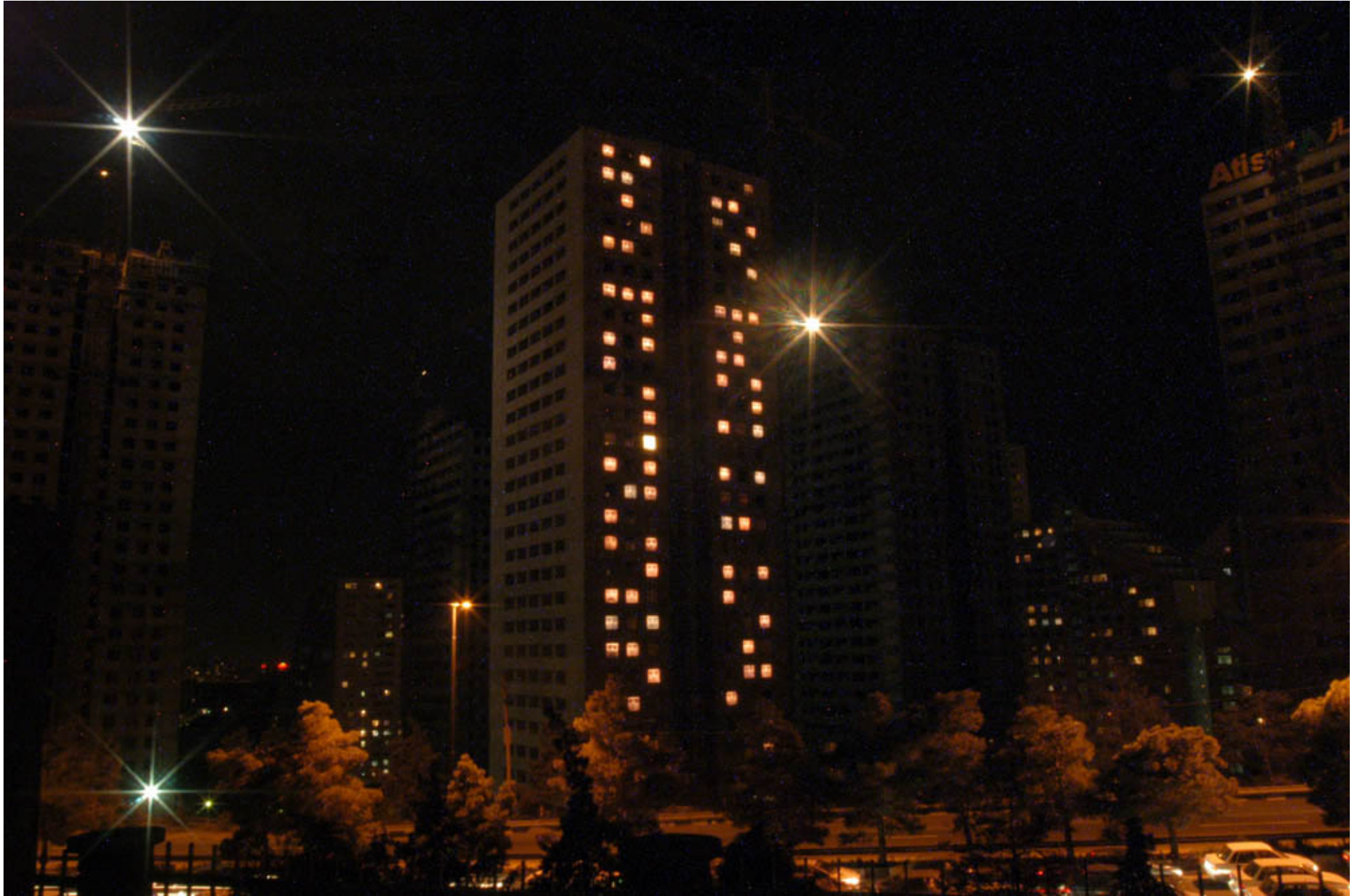
"Census", 2003, Public Art, Tehran