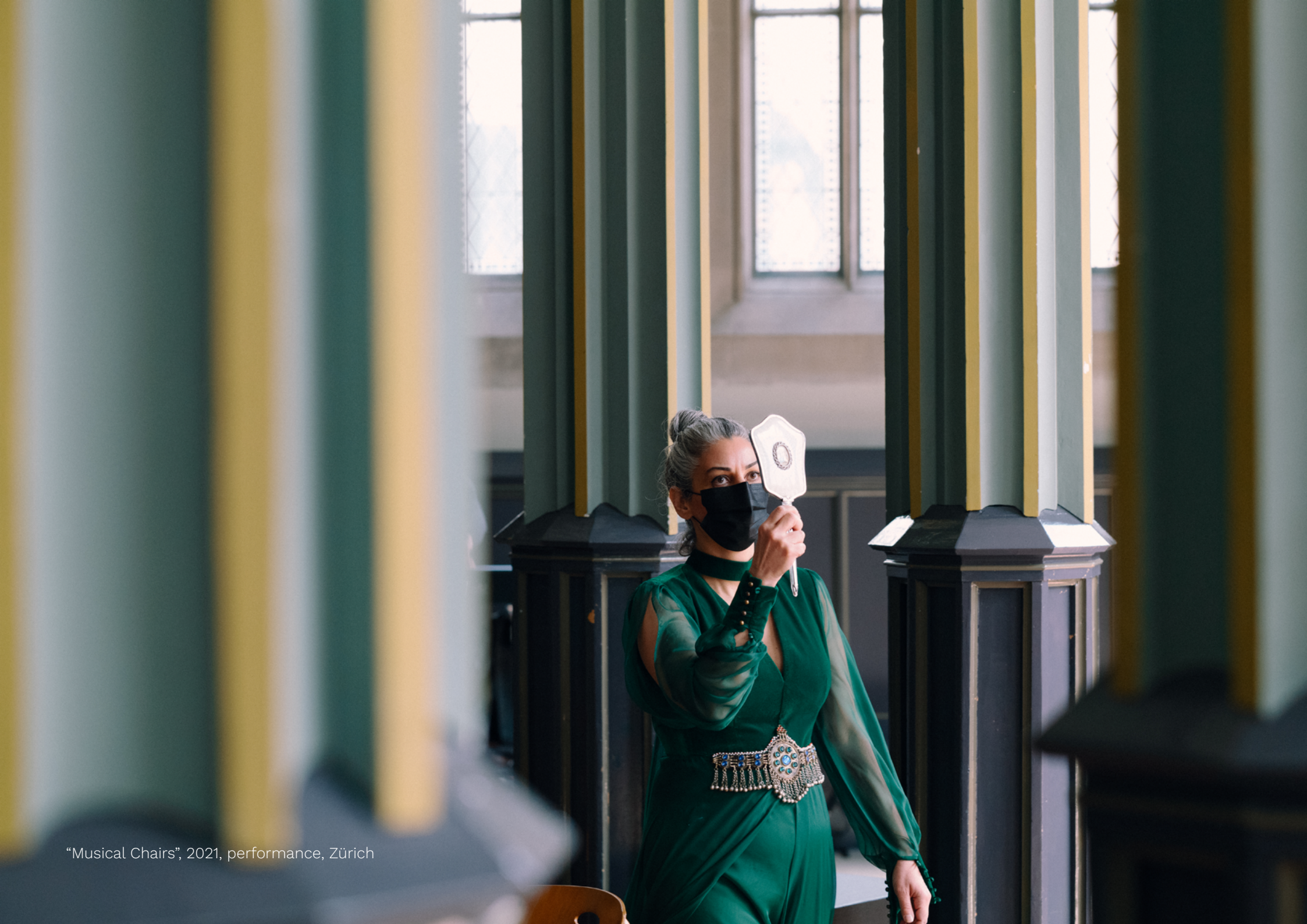
“Musical Chairs”, 2021, performance, Zürich