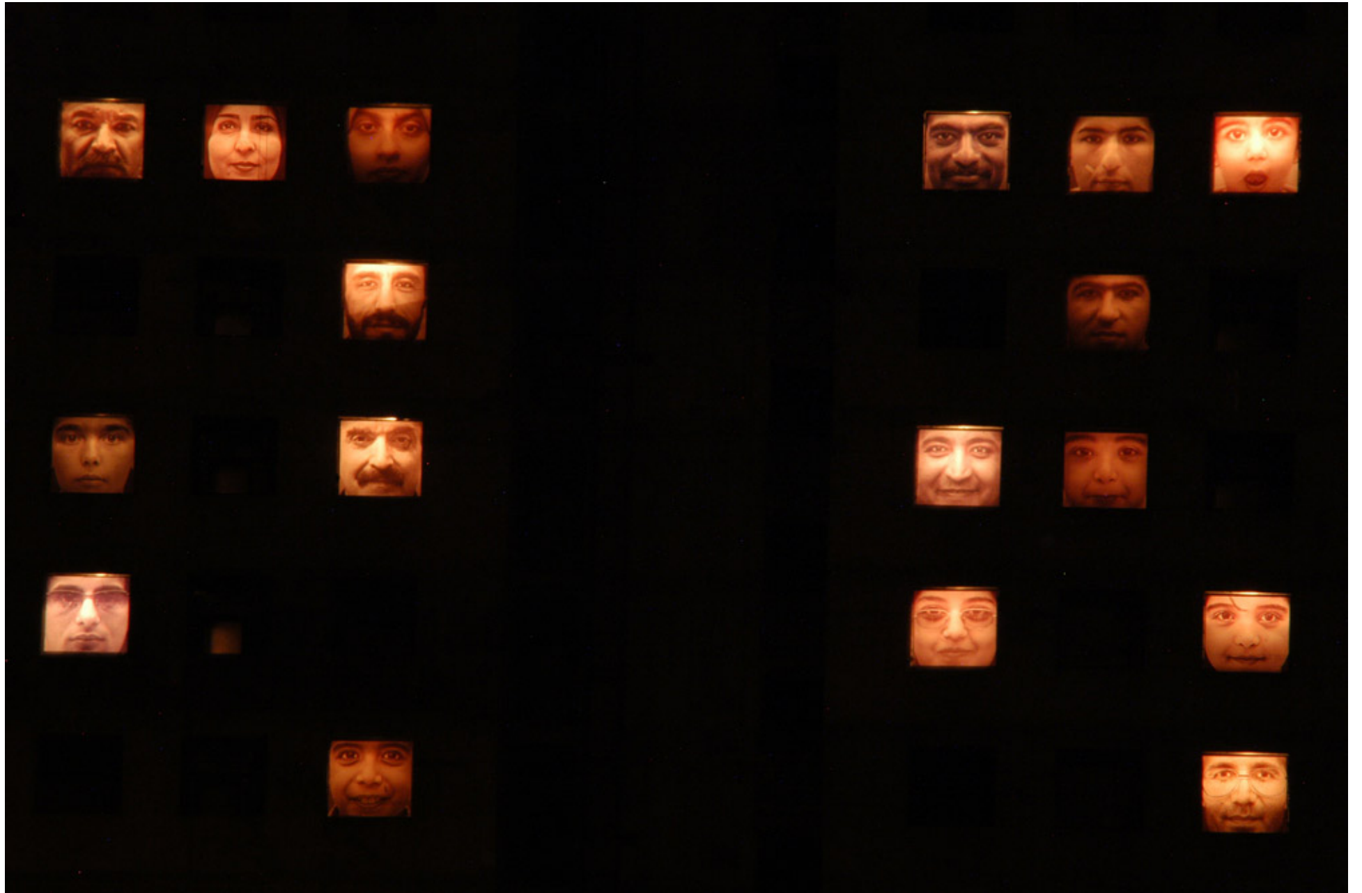
"Census", 2003, Public Art, Tehran