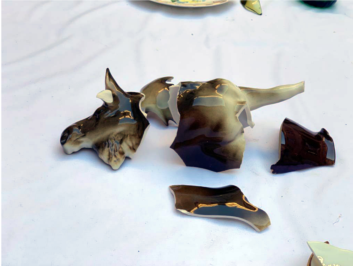
"Antifragility", 2022, Installation and Performance, Paris, London