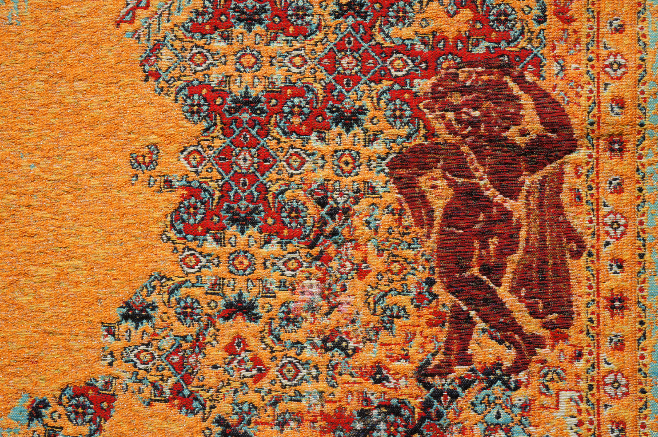
"Silk Road ", 2012, Tapestry