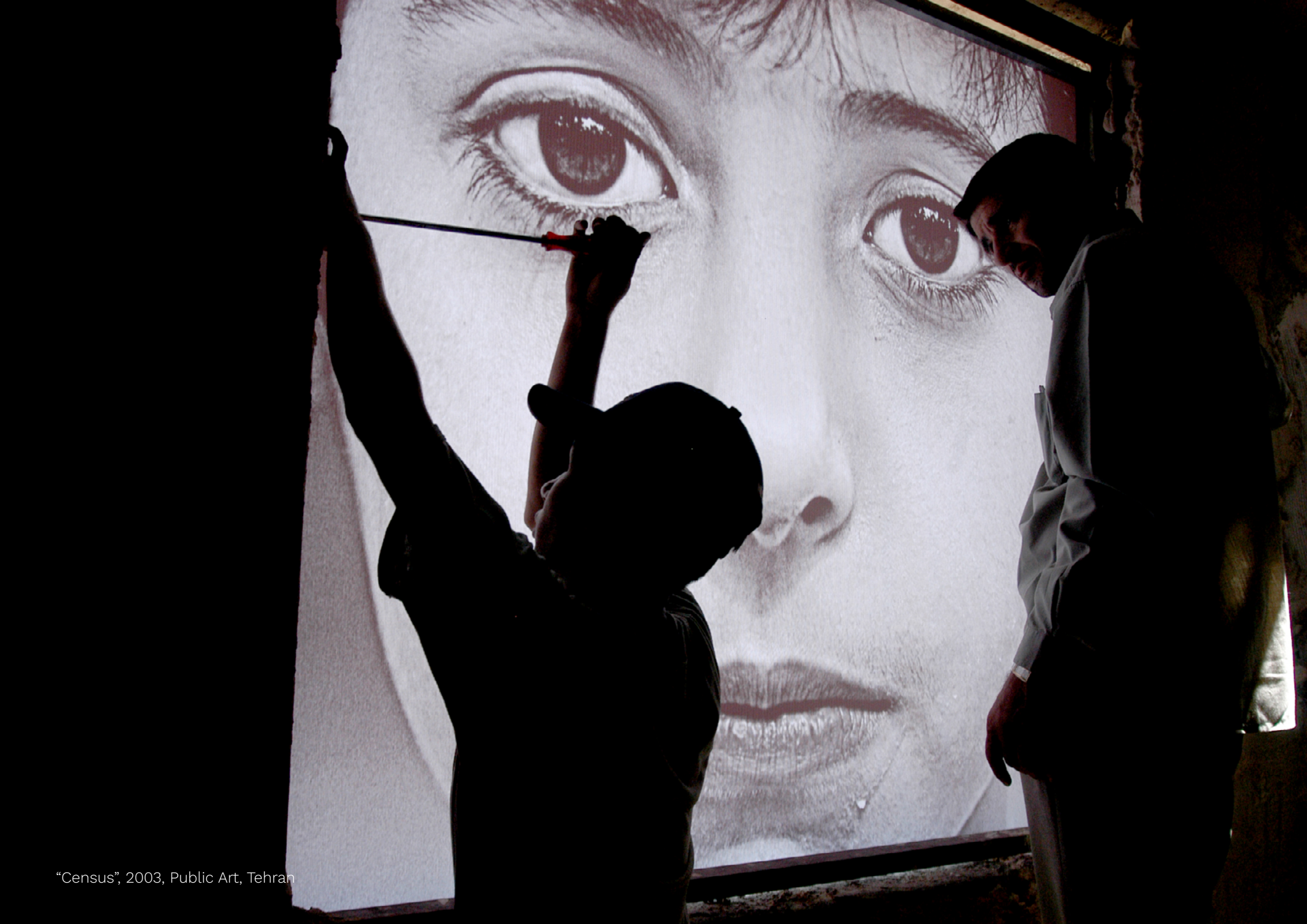
"Census", 2003, Public Art, Tehran