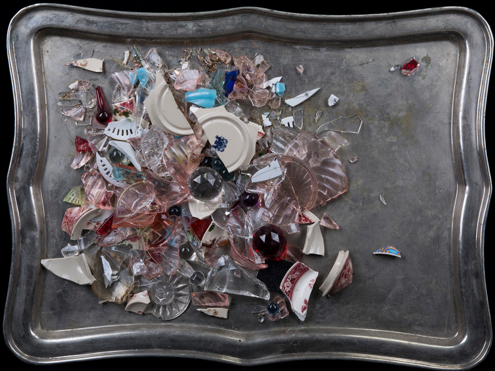
"Edge of Chaos", 2015, Sculptures, Light Boxes and Photographs, Tehran