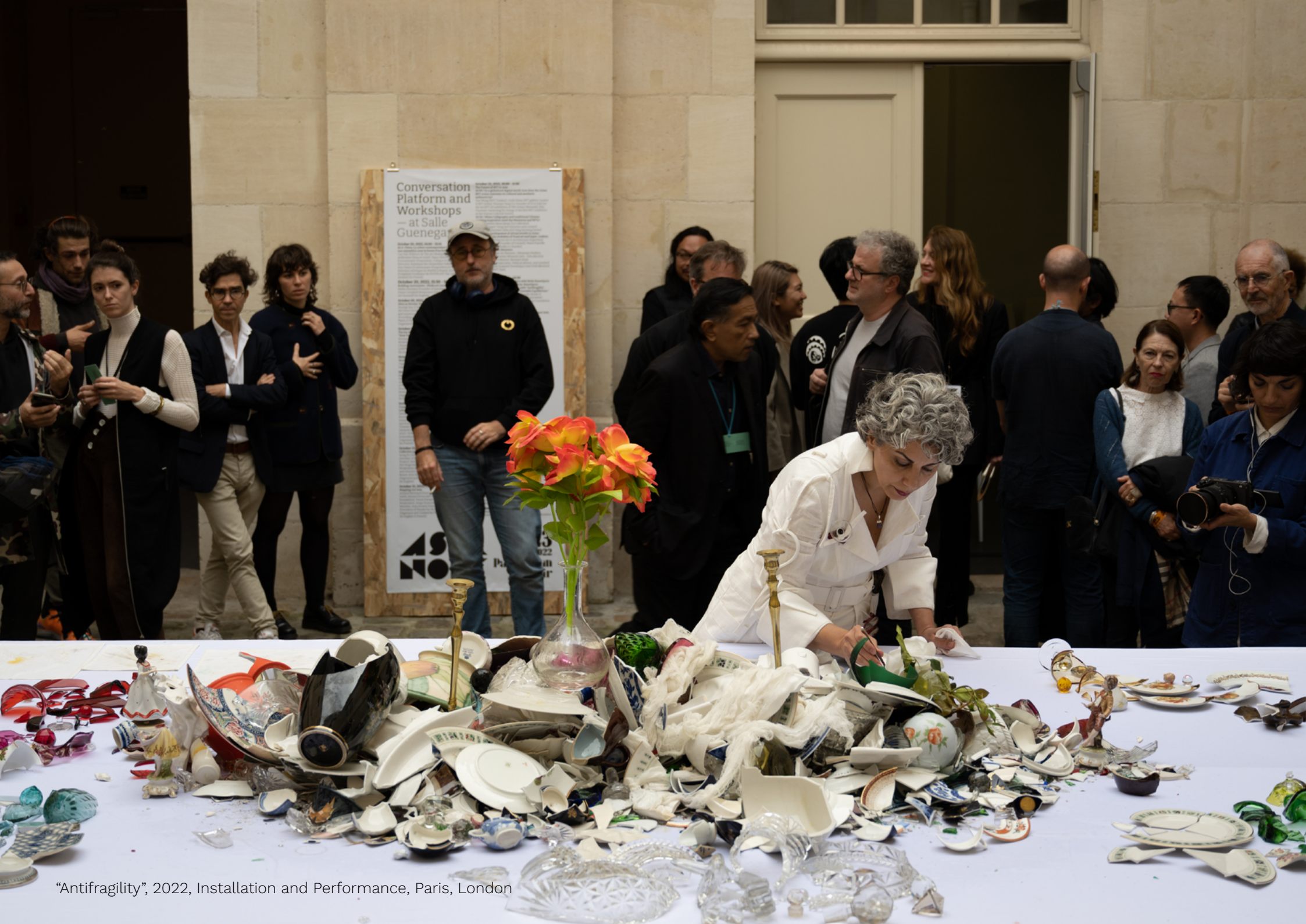
"Antifragility", 2022, Installation and Performance, Paris, London