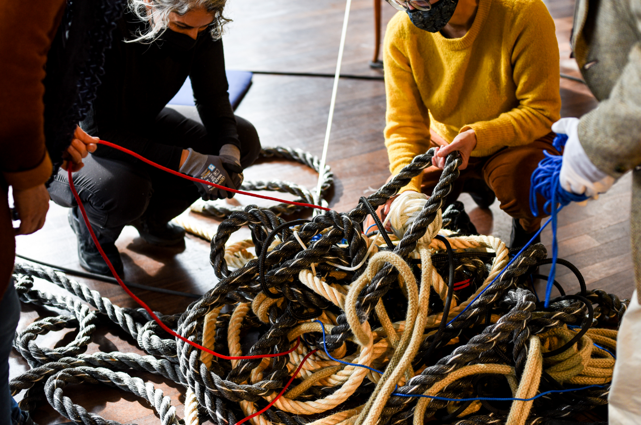
“Gestures that must not be forgotten”, 2020-2021, Public Performance, Zürich