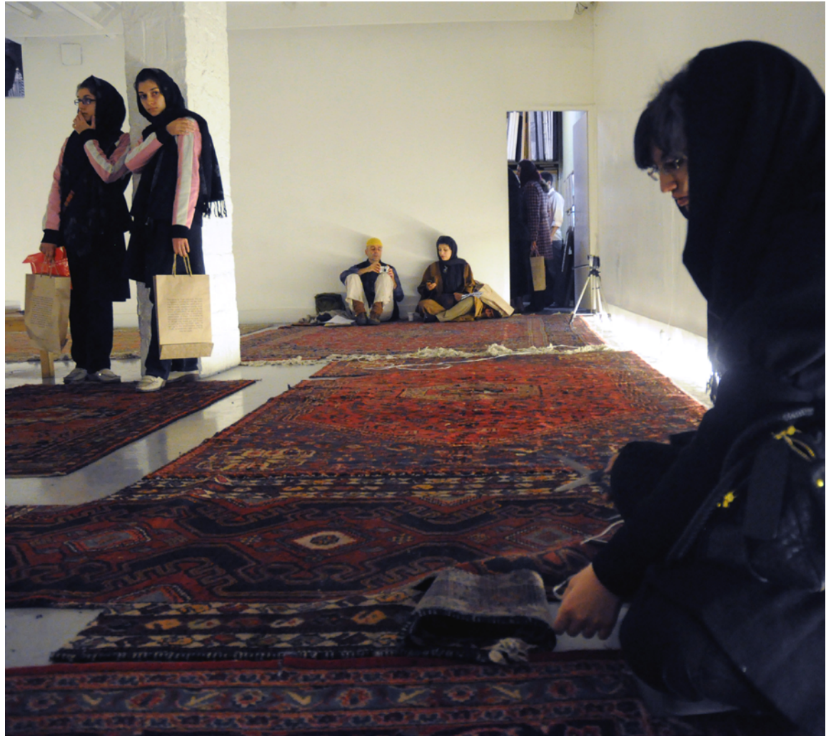
“Self Service”, 2009, Installation and Performance, Tehran