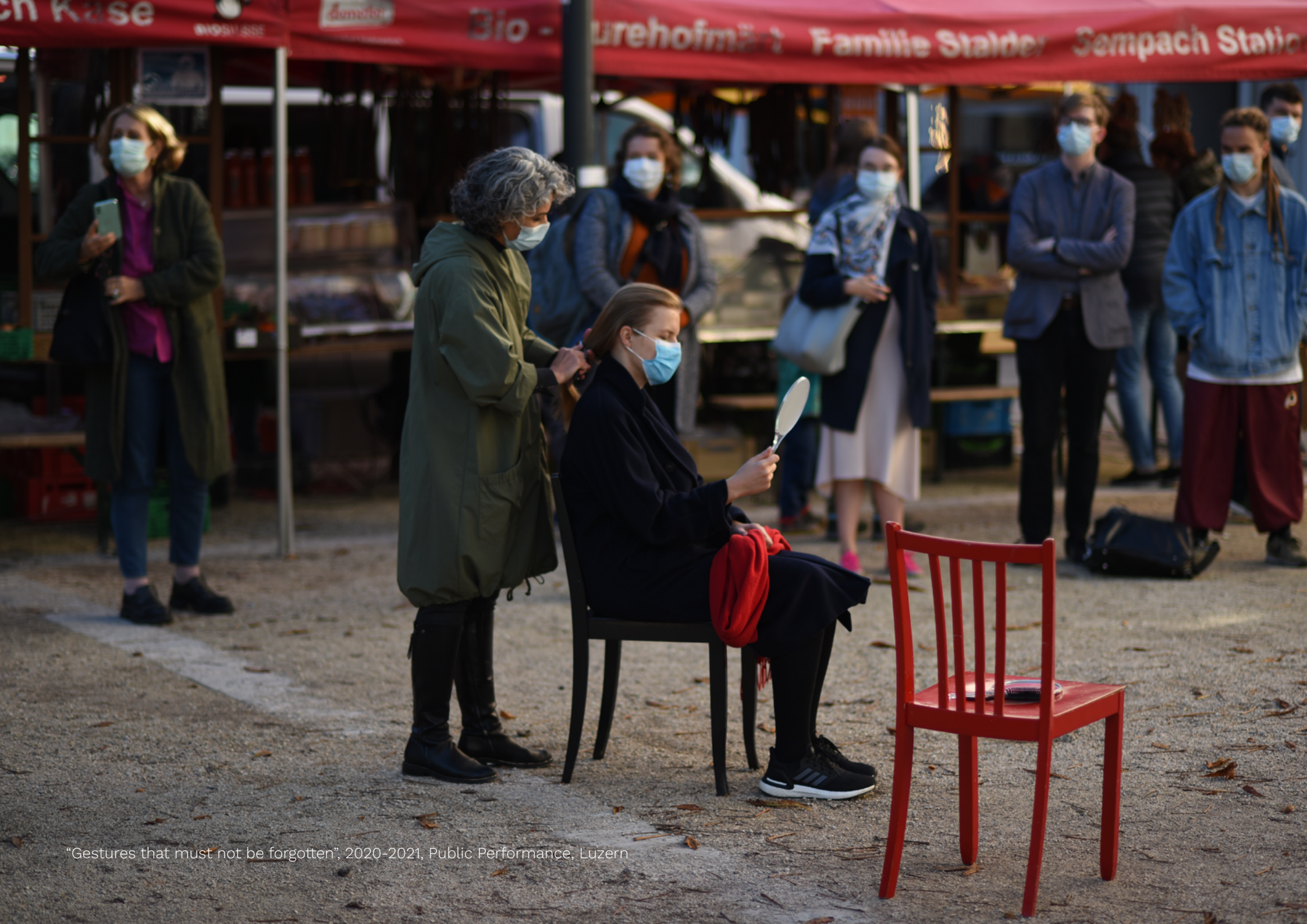
“Gestures that must not be forgotten”, 2020-2021, Public Performance, Luzern