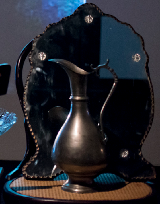
"Traveling Pieces", 2015, Installation and Performance, Warsaw