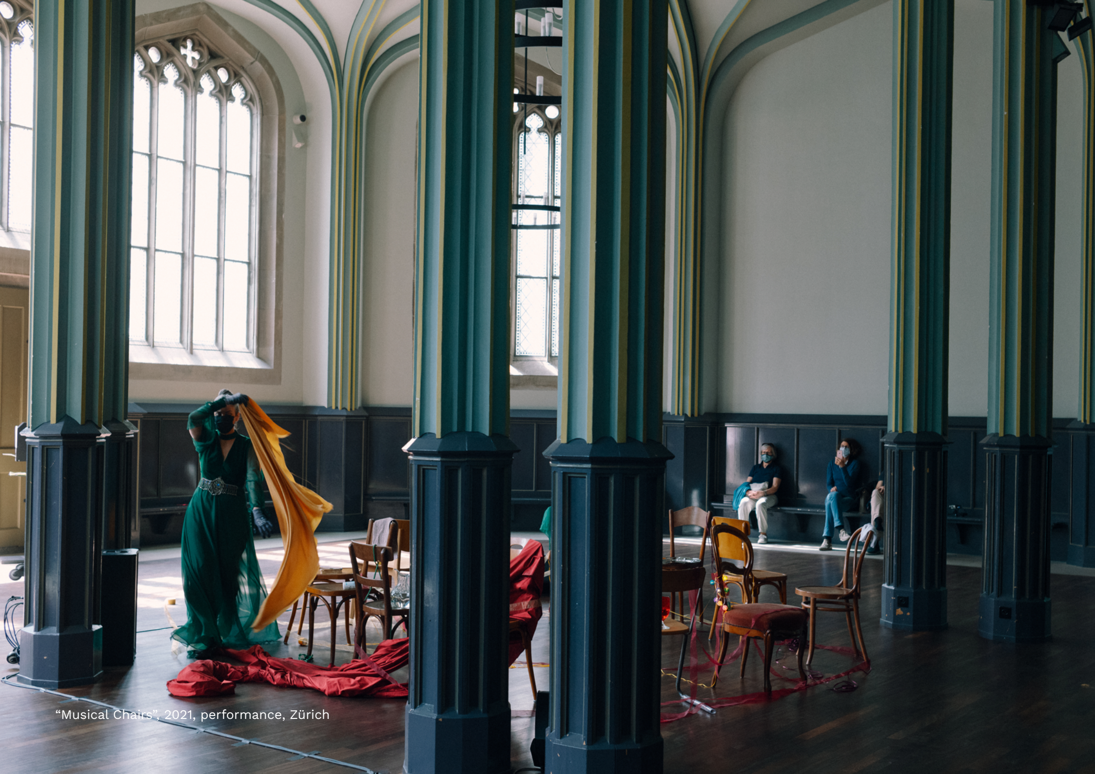
“Musical Chairs”, 2021, performance, Zürich