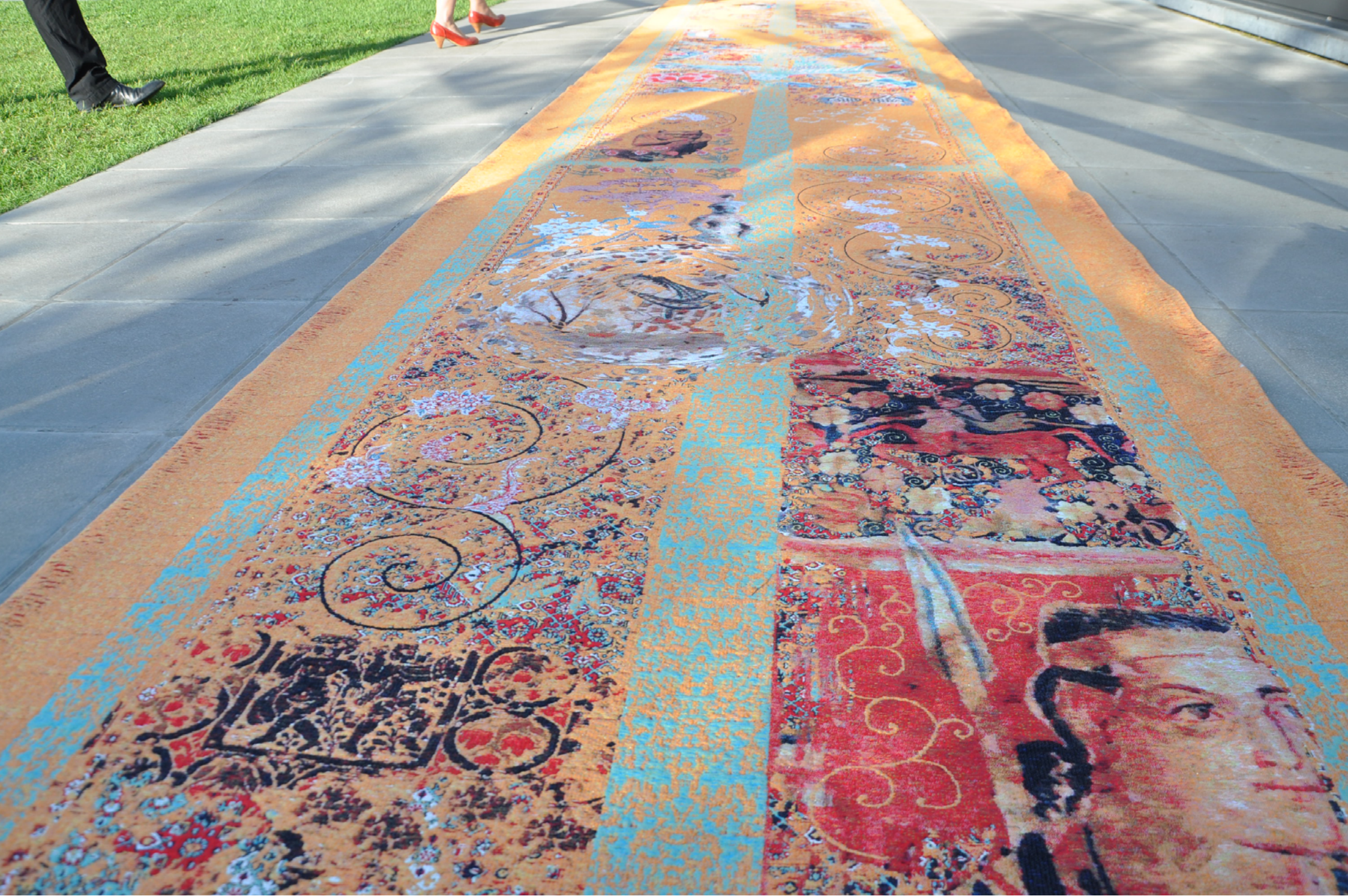
"Silk Road ", 2012, Tapestry