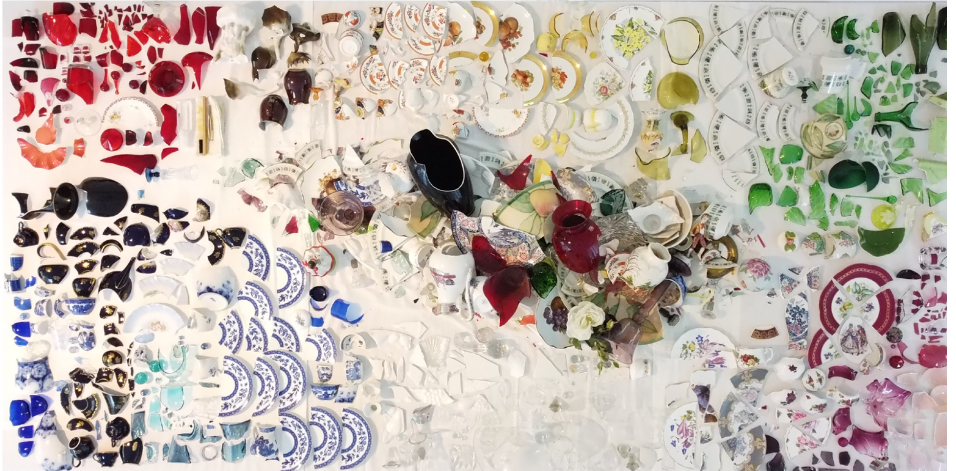
“Antifragility”, 2022, Installation and Performance, Paris, London