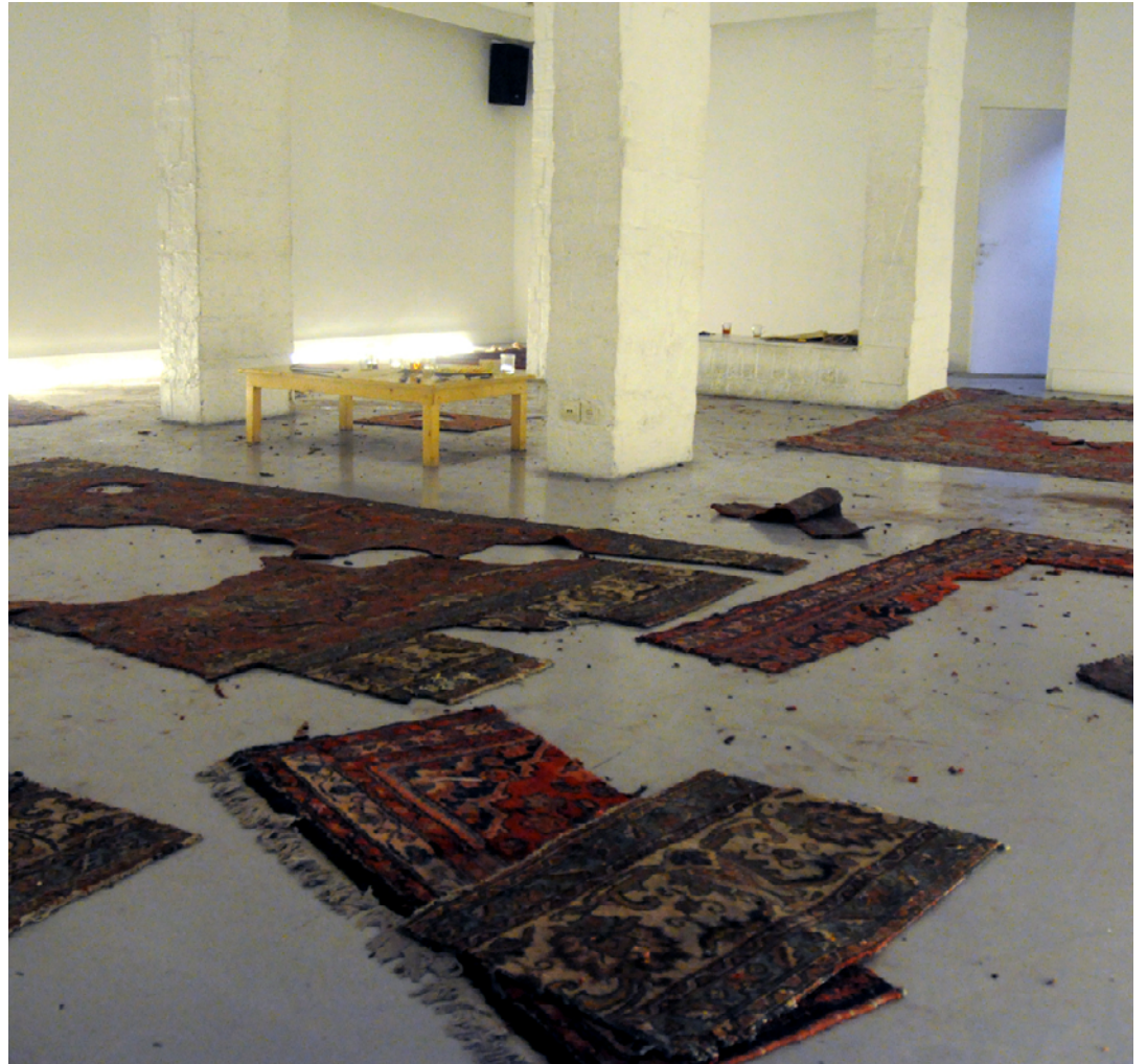
A range of used, handmade Persian carpets chosen from different parts of Iran, are presented to visitors. A few scissors and cutters are fastened by nylon strings. Viewers were invited to choose the part of the carpet they like, cut it, and take it with them. But before leaving, the participants were asked to place their selected pieces in a shopping bag, each tagged with a quote from Plato's Republic.