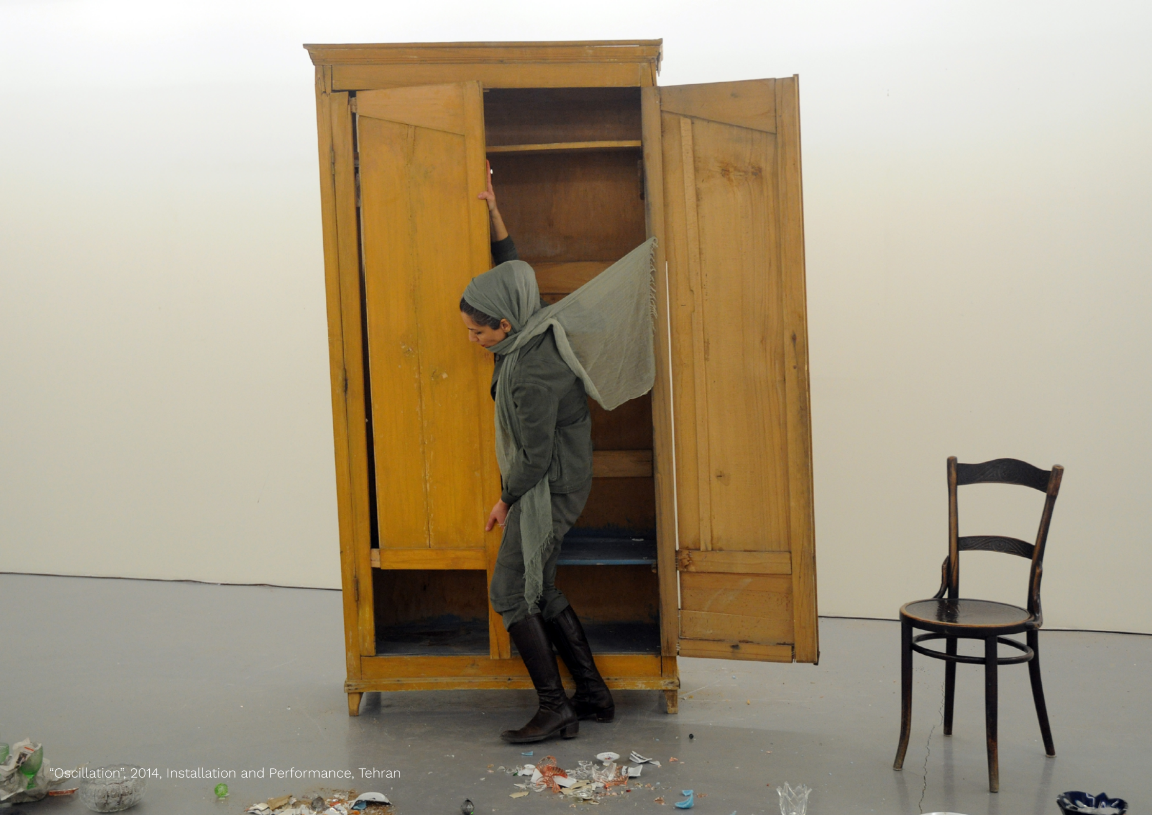
"Oscillation", 2014, Installation and Performance, Tehran